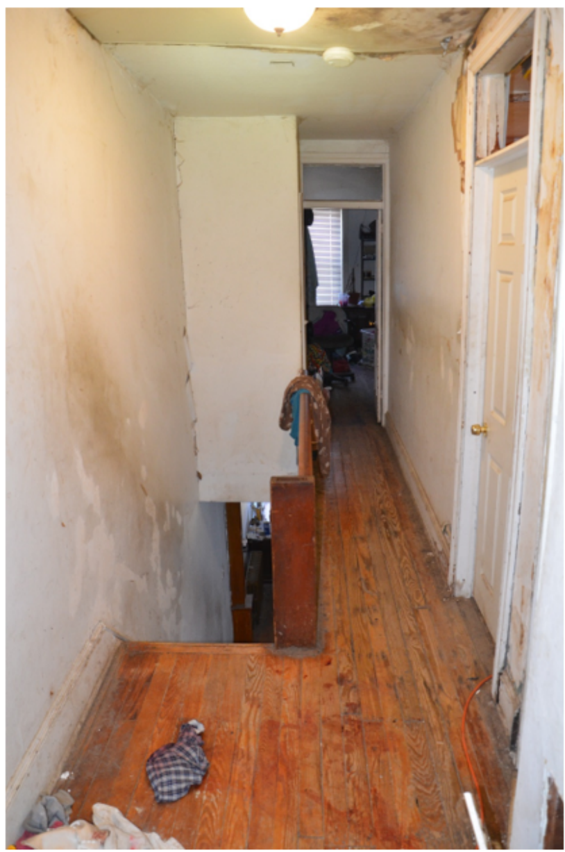
Figure 2 Perspective of Cpl. Crocker showing room from which Burton exited. Blood transfer on floor shows Burton's final resting place.