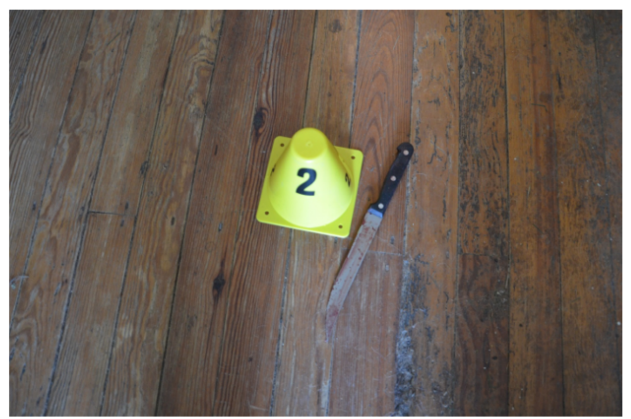
Figure 5 Close up, Burton's knife.