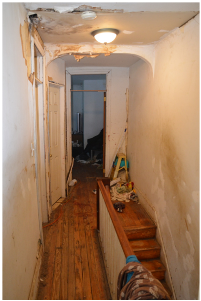
Figure 3 Perspective of Burton on his approach to Cpl. Crocker.