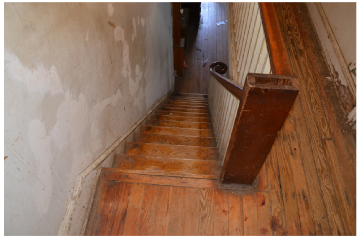
Figure 4 Final resting place. Burton's knife fell through balusters after Burton was struck by gunfire.