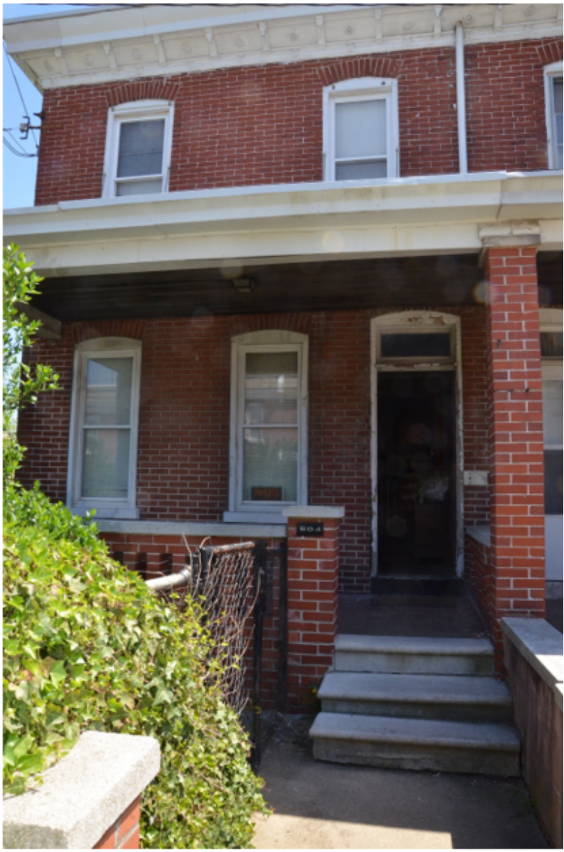
Figure 1 Exterior 604 S. Heald St.

The location of the incident is the residence of 604 S. Heald Street, Wilmington, Delaware.