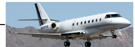
N200VR Registered in Miami, FL Gulfstream 200 Manufacturer's Serial Number 133