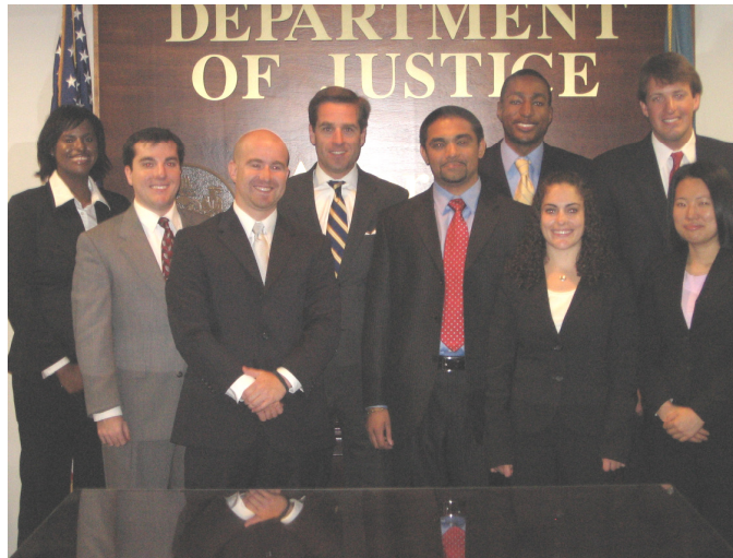
Attorney General Biden and Summer Law Clerks

Candidates are encouraged to apply early as offers are extended beginning in October.